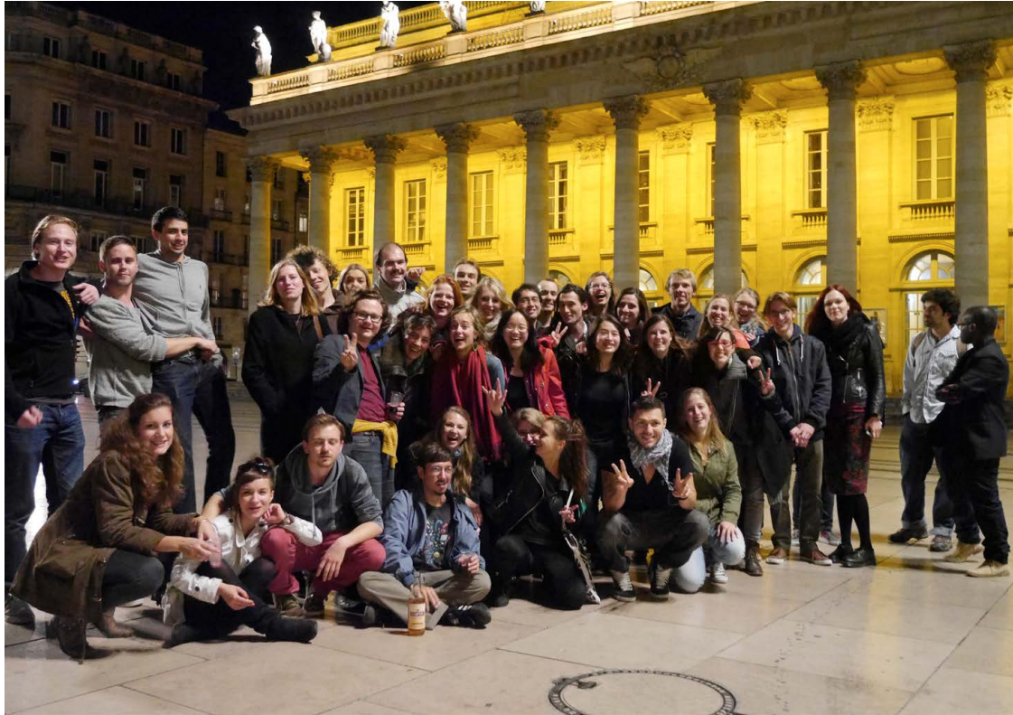
Group picture taken during the study trip to Bordeaux. The report is on page 3!