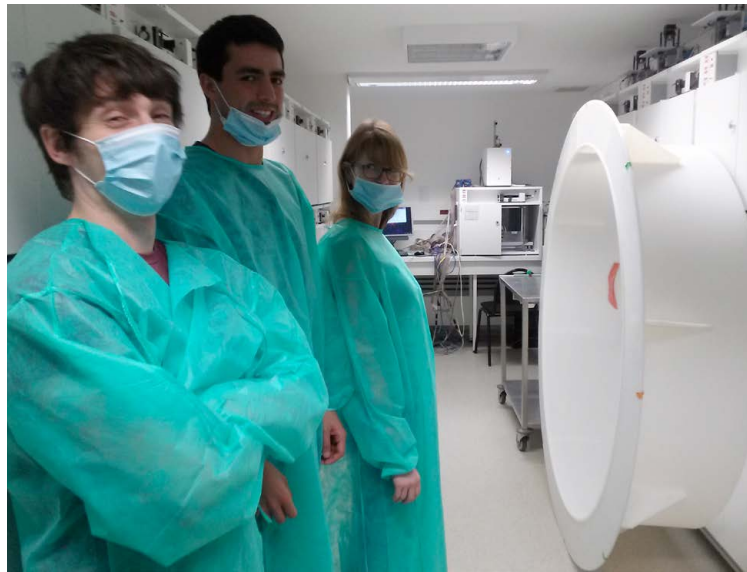
Suited up for lab rotations.

While final exams, research proposals, and presentations kept us busy, we at least had one thing to look forward to when it was all over: Bordeaux. Finally, the celebration began in the early morning of Wednesday, 22 October, when we awoke at the ass-crack of dawn, filed into a bus at Amstel Station, and began a fifteen-hour drive to the scenic French city where we would meet top-level researchers at the Université de Bordeaux and be treated to some top-level wine. Of course, some people didn't need to wait for our arrival in Bordeaux before the celebrations started. Excitement filled the bus, even at such an early hour, as we applauded the bus driver